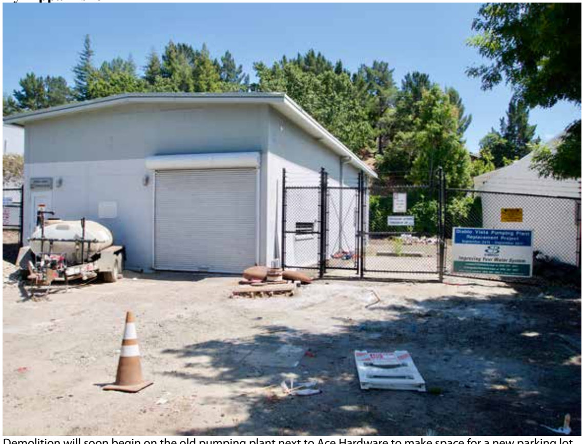
Demolition will soon begin on the old pumping plant next to Ace Hardware to make space for a new parking lot.

the east end of Lafayette is getting phase of work – the demolition of pumping plant located at the south-